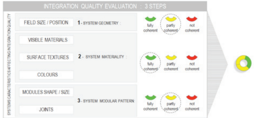
▲ Figure 1. Quality evaluation steps and resulting graphic representation.

New energy regulations, together with mandatory solar fractions for electricity and Domestic Hot Water are introducing new materialities and geometries in buildings, resulting in new forms of architectural expression that are slowly modifying our city landscapes. The increased use of active solar collectors in buildings is clearly necessary and welcome, but brings major challenges in already existing environments. The large size of solar systems at the building scale asks for thoughtful planning, as these systems may end up compromising the quality of the building, threatening the identity of entire contexts.