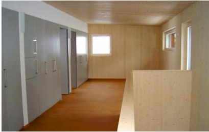
Open working space on the upper floor