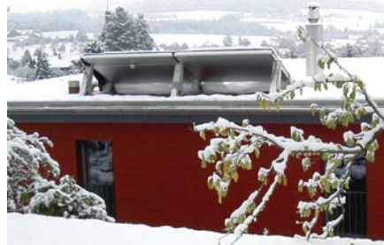
Solar thermal collectors and weather sensor on the roof