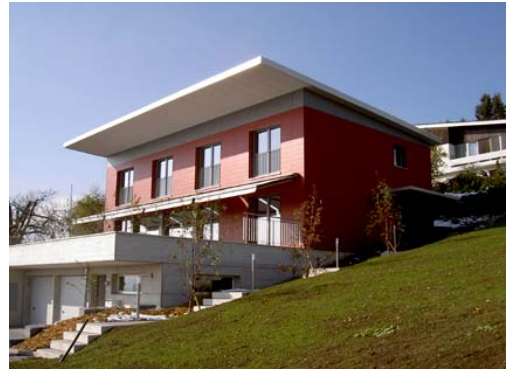
View from the south-east